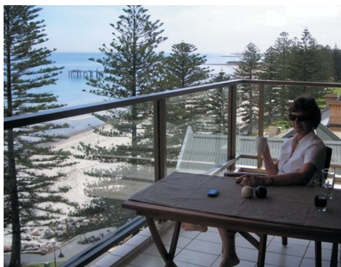
Figure 1 View of the beach at Glenelg where W. H. Bragg first set foot on Australian soil. In 1886 ships frequently anchored offshore and passengers and luggage were ferried ashore in tenders (Jenkin, 2008). The trees in the foreground are Norfolk Island Pines, not native to Australia, and not planted at the time of Bragg's arrival. Photograph taken from the condominium of the author and his wife, Helen (seated, right).

Third, Bragg was more than happy to reminisce about his memories of growing up as a small boy in Adelaide. The city is built on a coastal plain and at the time was serviced by a network of horse-drawn trams. Because of the flat terrain, each tram could be pulled by a single horse. There was one exception, however, where the tram left the center of the city and went up a short hill to the suburb of North Adelaide.